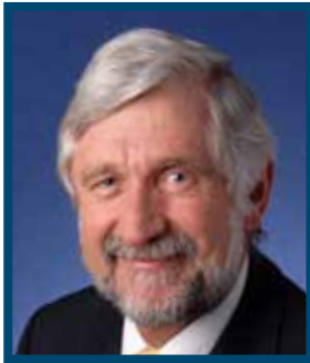
CEO and General Manager New South Wales