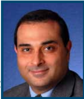
National Manager for Policy and Government Affairs