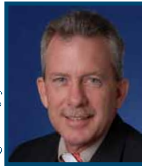
General Manager Queensland, National Training Policy Manager