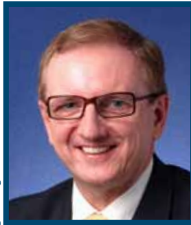
National Communication and Technical Services Manager