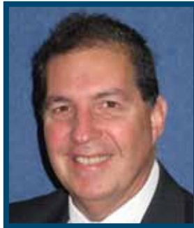
National Manager, Learning and Development