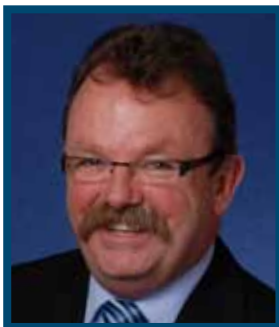
General Manager Victoria and Tasmania, National Sales Manager