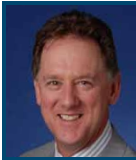
General Manager South Australia and Northern Territory, National Special Projects Manager