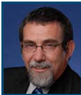
General Manager Western Australia, National Environment Manager