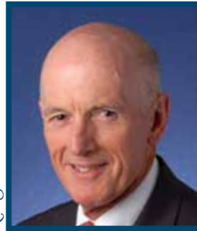
National Employee Relations and OH&S Services Manager