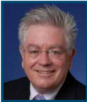
General Manager Australian Capital Territory